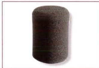
W 1000 windscreen

In demanding live sound or recording applications, the C 1000 S is as flexible and dependable as a Swiss army knife.