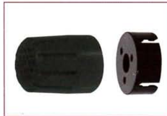
Polar Pattern Converter (left) and Presence Boost Adapter (right)

AKG Acoustics GmbH Lemböckgasse 21-25, P.O.B. 158, A-1230 Vienna/AUSTRIA Tel: (+43 1) 86 654-0*, Fax: -7516, e-mail: sales@akg.com