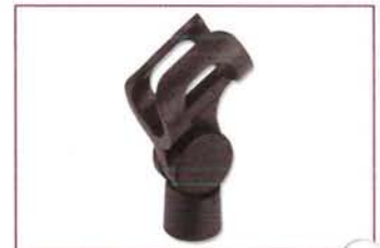
SA 63 stand adapter

The red LED above the microphone switch stays illuminated when the remaining battery life falls below 45 minutes. When the mic is turned on, the LED blinks briefly to indicate that a usable battery is correctly inserted. The LED does not function when phantom power is used.