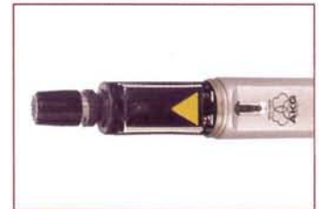
Choice of phantom power supply or internal 9 V battery