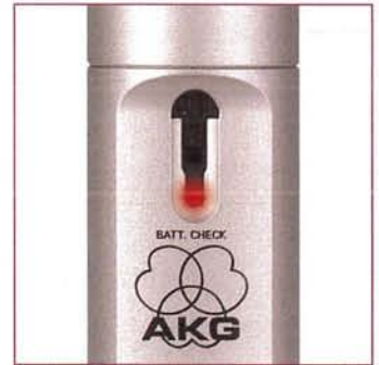
Battery status LED: Battery ok – LED blinks briefly

The red LED above the microphone switch stays illuminated when the remaining battery life falls below 45 minutes. When the mic is turned on, the LED blinks briefly to indicate that a usable battery is correctly inserted. The LED does not function when phantom power is used.